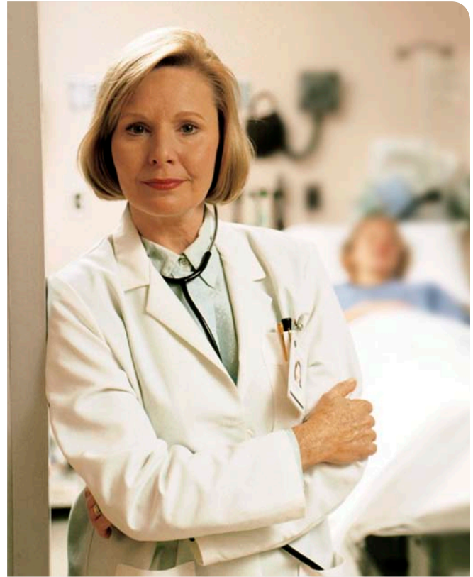
In ICU, patients are watched very closely by highly trained healthcare professionals.

You're watched around the clock. The care you get here will help you recover safely and quickly. You may stay for several days, depending on the type of heart surgery and the time you need to recover. Then you may go to a regular hospital room.