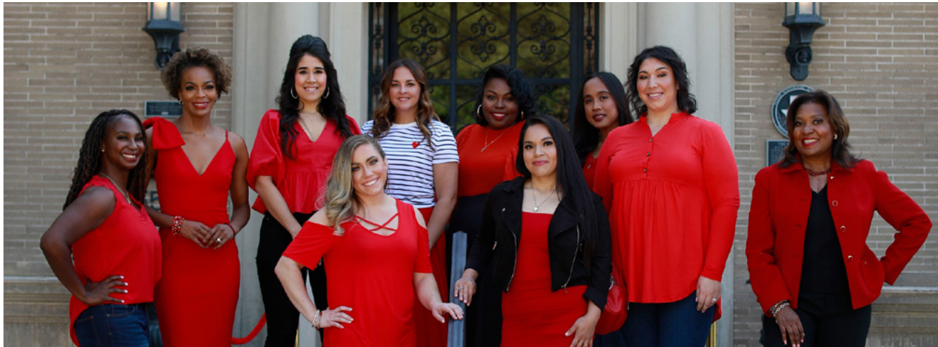
Members of the 2022 Class of Go Red for Women Real Women

Each year, Go Red for Women selects a class of Real Women — heart disease and stroke survivors who share their personal experiences to raise awareness and inspire women around the globe.